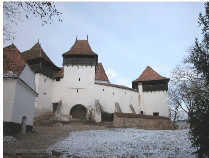
Left: Heddal stave church, Norway. Right: Weisskirch, Saxon fortified church, Romania.