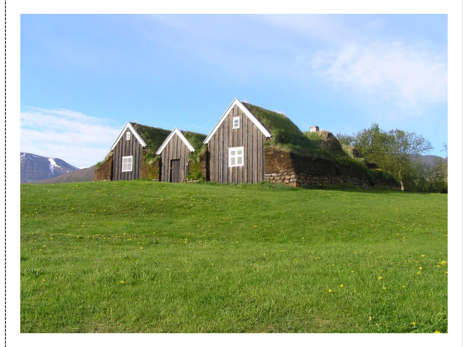
European Heritage Heads Forum Reykjavík 2017 7th – 9th June "Our Common Heritage – Sharing the Responsibility"