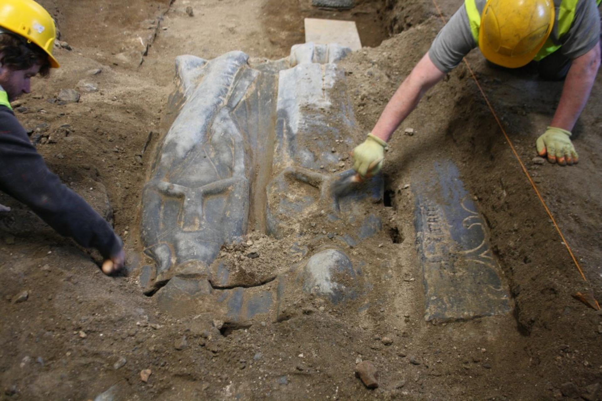
Recent discovery of 14 th century double effigy at St Mary's Kilkenny.