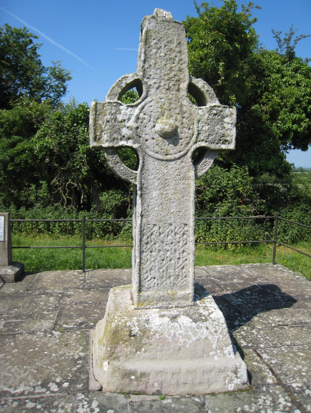
High Cross at Kilree, an example of Early Christian Sculpture