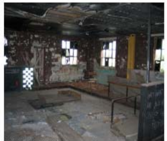
Building B-8, 1st floor bar area to the southwest