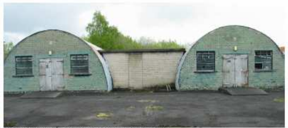
Buildings E8/1 & 2 from southwest, Buildings E8/4 & 5 behind