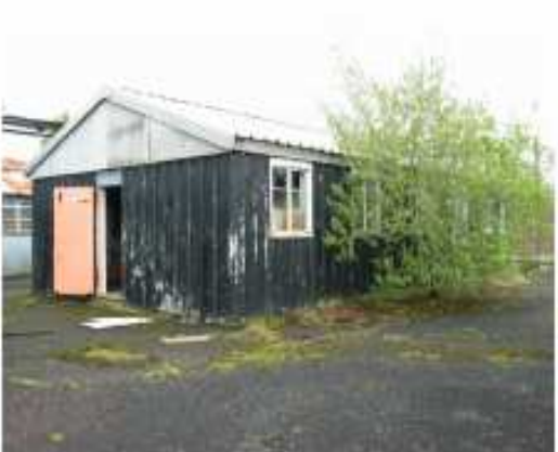
Building E8/6 from south