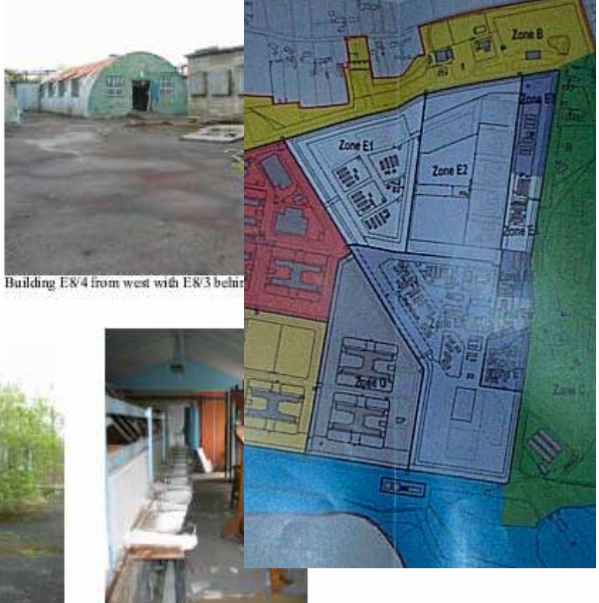
Interior, Building E8/6