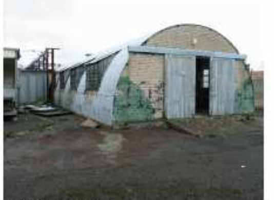
Building E8/5 from west