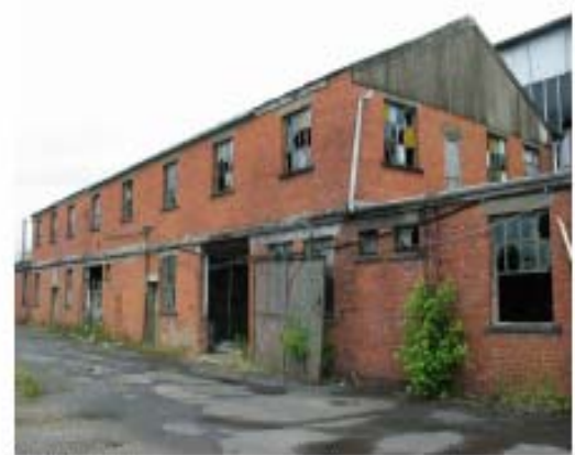
Building B-8, two storey section of west extention