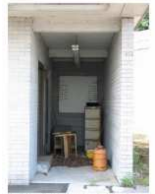
Building B/40 showing height chart