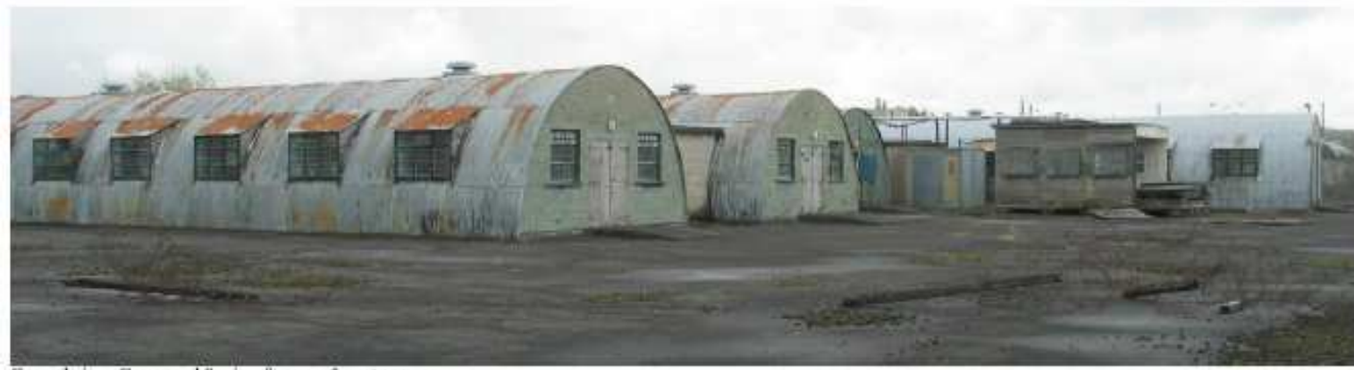
General view, Compound 8, view from northwest corner