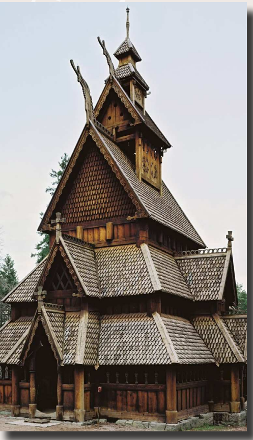
Akershus Castel, The Viking ship Museum, The Norwegian Museum of Cultural History