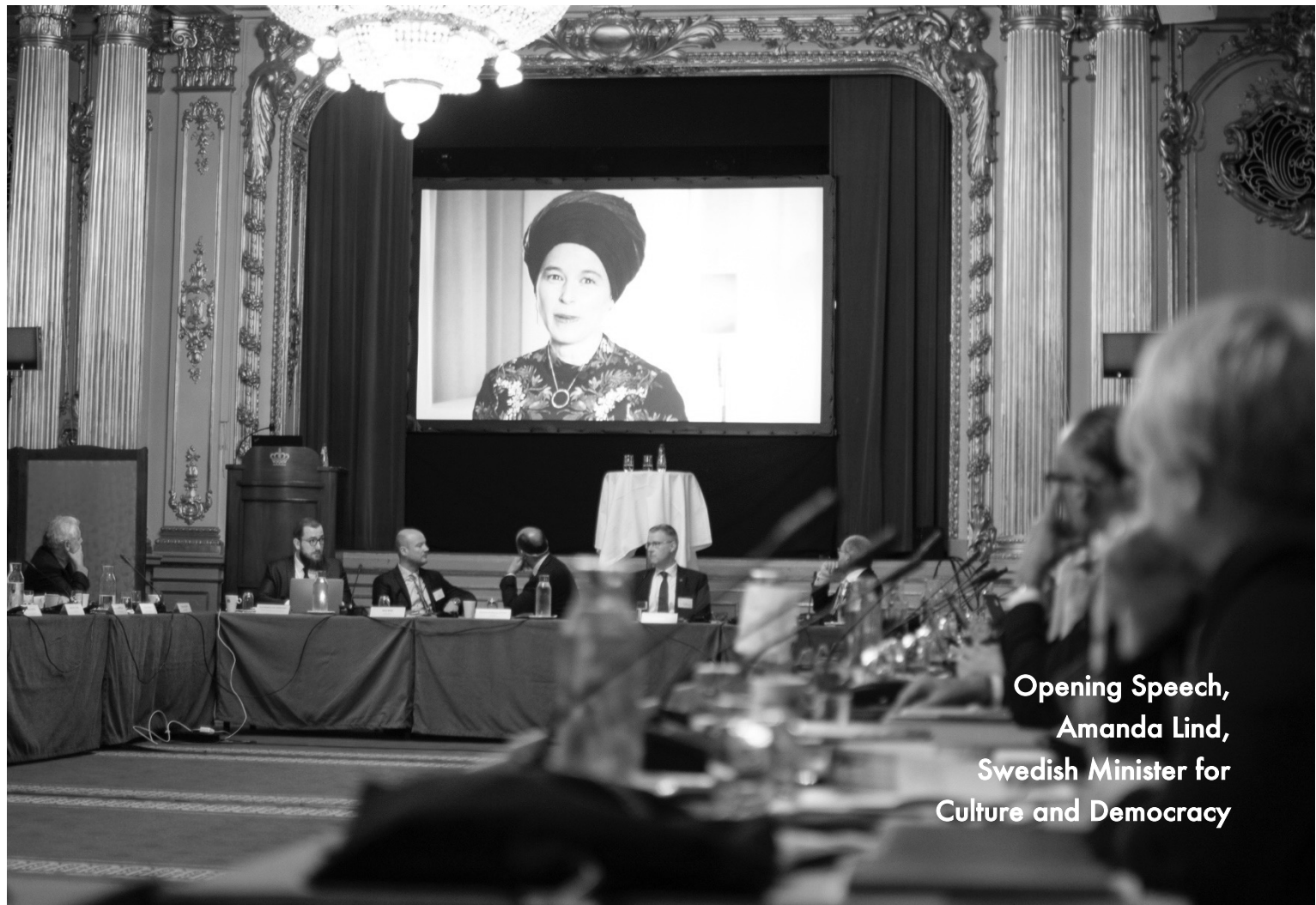
Opening Speech, Amanda Lind, Swedish Minister for Culture and Democracy