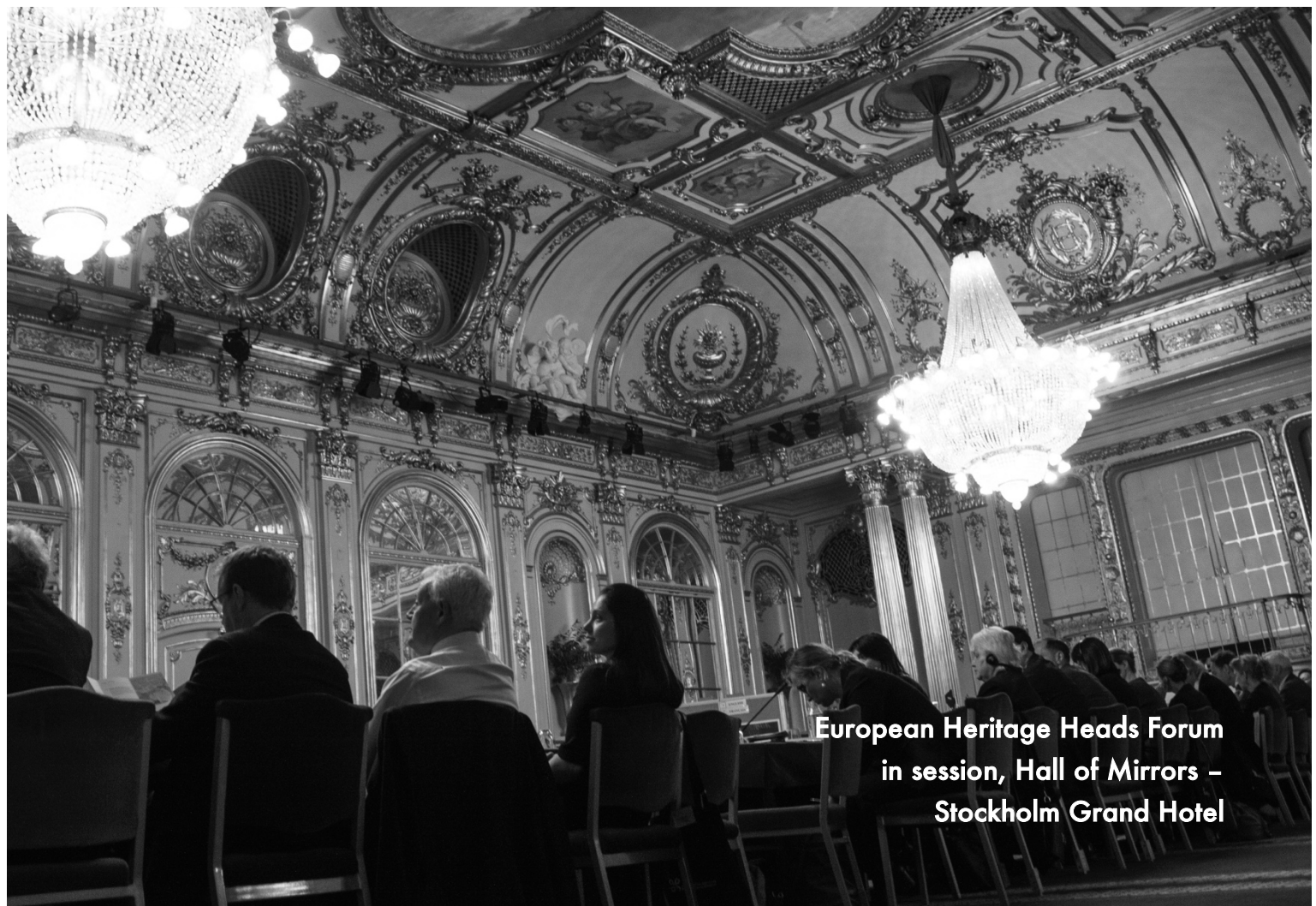
European Heritage Heads Forum in session, Hall of Mirrors – Stockholm Grand Hotel