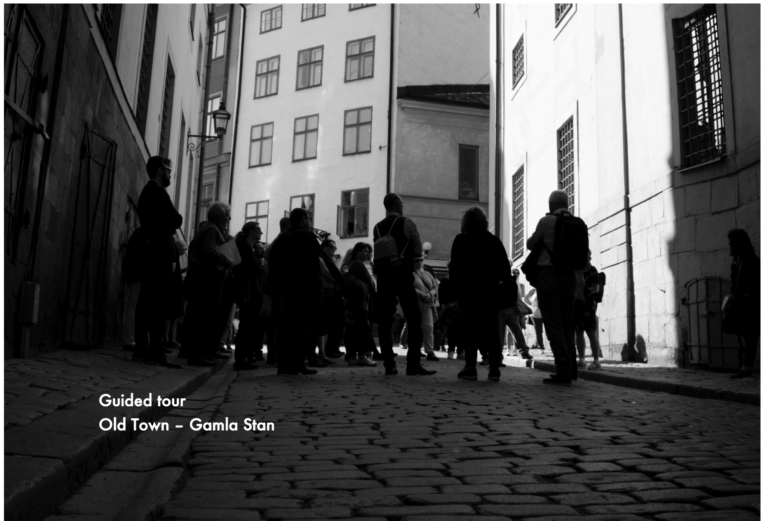
Guided tour Old Town – Gamla Stan