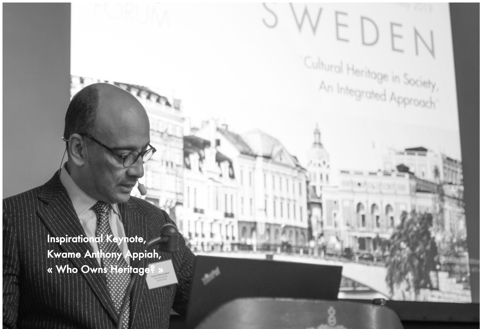
Inspirational Keynote, Kwame Anthony Appiah, « Who Owns Heritage? »