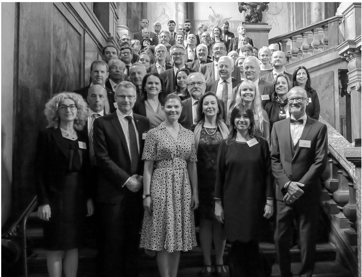
Audience with HRH Crown Princess Victoria of Sweden

The members of the Forum were invited to a visit to the Royal Palace and an informal audience with HRH Crown Princess Victoria of Sweden. The visit included a presentation of the renovation of the palace by the Swedish National Property Board . The idea behind this visit was to present the pressures involved in managing an iconic heritage environment that serves as a home, as a work place and as a tourist attraction. The ongoing cooperation between the Royal Court and the National Property Board is committed to finding new solutions to reflect an ancient institution in a modern Sweden. A wide range of measures are being taken to ensure the palace will be able to face the challenges of tomorrow, and to keep on developing its activities in a sustainable way. Amongst these projects, the gradual conversion to LED lighting, the transition to electric cars for the Court and of course, the ongoing project of mounting solar panels on the roof.