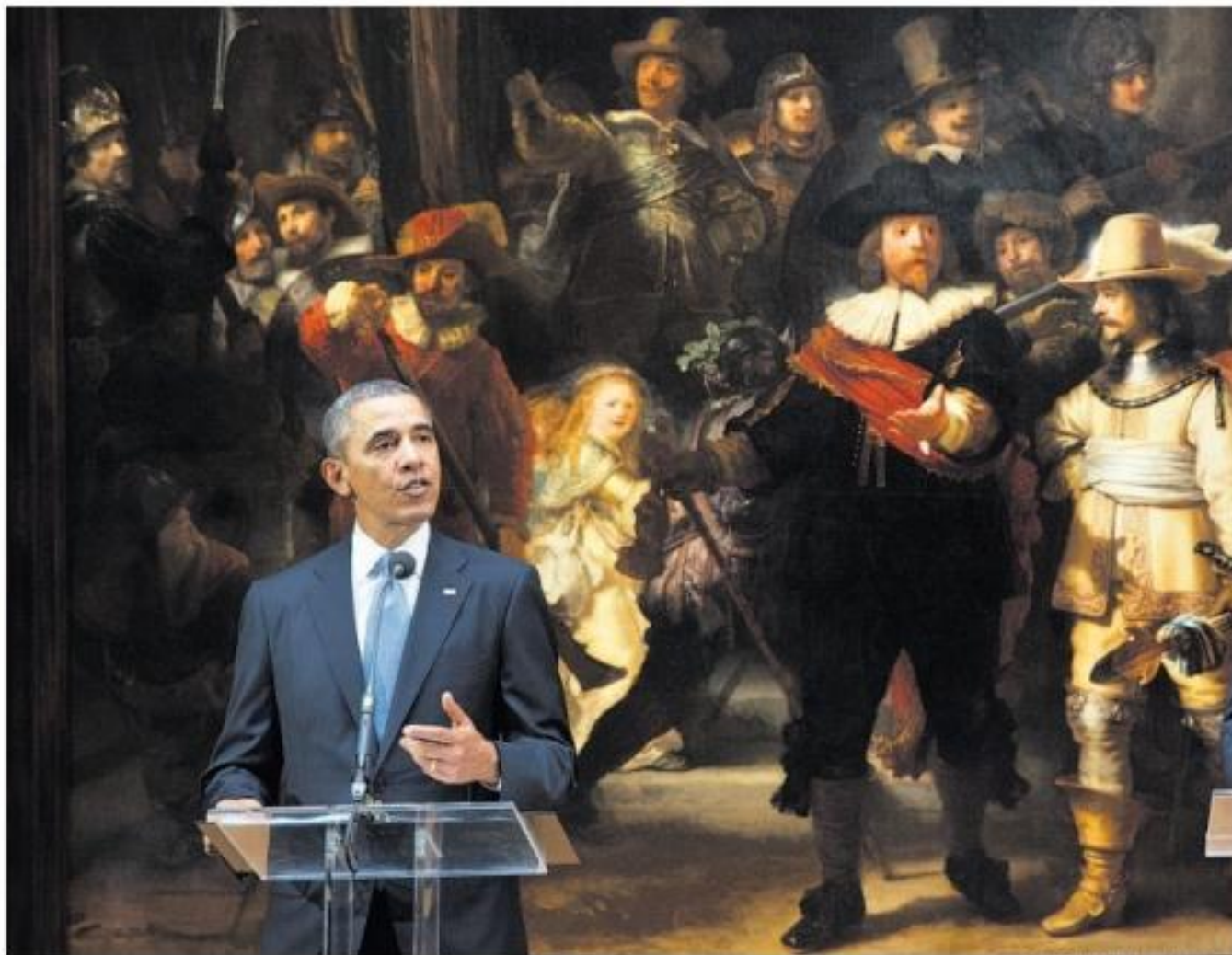
President Obama spoke Monday at the Rijksmuseum in Amsterdam in front of the Rembrandt painting "The Night Watch."

In the months and years that followed, as a trove of internal documents and studies was unsealed, G.M. told the families of accident victims and other customers that it did not have enough evidence of any defect in its cars, interviews, letters and internal documents show. Last month, G.M. recalled 1.6 million Cobalts and other small cars, saying that if the switch was bumped or weighed down it could shut off