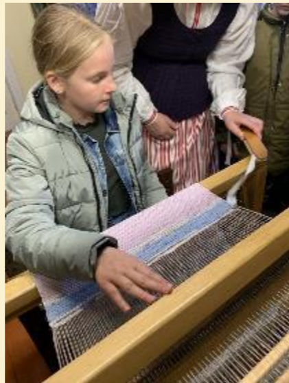
The tradition of making woven sashes