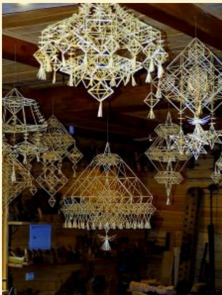
Tradition of straw gardens