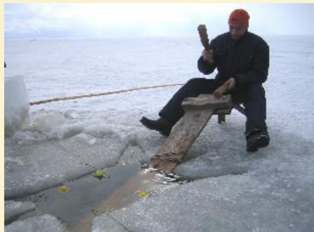
Ice-knocking fishery of smelts

55 protected Values are included in the List of ICH , but the process is ongoing since 2017 and every year 7-10 new values are added