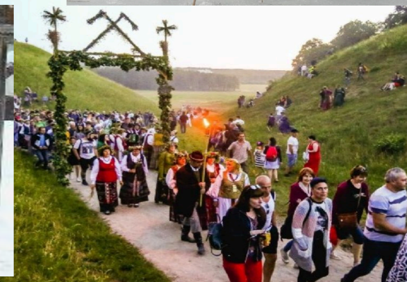
Hollow-tree beekeeping, Ice-knocking fishery, Winter (Užgavenės) and Midsummer(Rasos) festivals