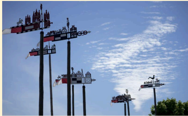
The making of Curonian Lagoon boats' weathervanes